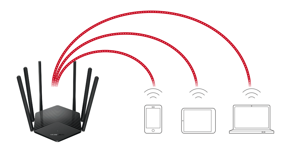
MR50G with MU-MIMO

With MU-MIMO, MR50G communicates with multiple devices at the same time to allow connected devices to achieve faster speeds than standard AC routers, increasing overall network throughput.